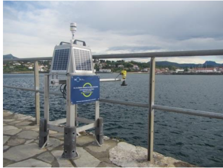
EPONIM mobile tide gauge in Saint-Jean-de-Luz